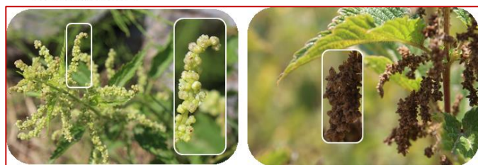
Fig. 6. Urtica dioica (Flowers)