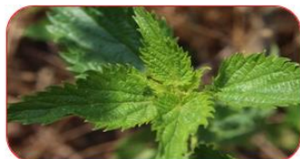
Fig. 5. Urtica dioica (Leaves)