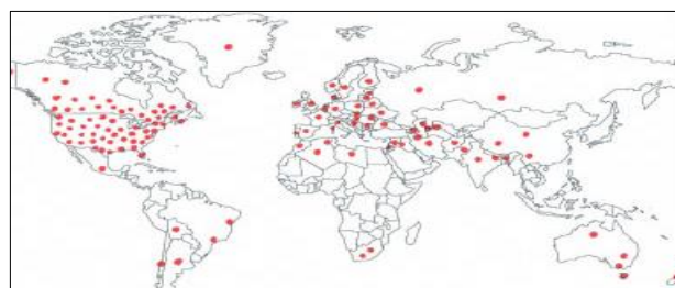
Fig. 1. Plant Distribution Map of nettle usage around the world

tannins [20]. The cytotoxic and genotoxic effects of nettle essential oil were evaluated and a considerable correlation has been observed between the essential oil concentration and the following: chromosomal aberrations, micronucleus abundance, apoptotic cells, necrotic cells, and dual nuclear cells [21]. This plant has been utilized in both medicine and food form in many countries especially in the Mediterranean region and it has been plenary analyzed the pharmacological, chemical, and botanical aspects [22].