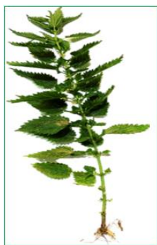
Fig. 4. Urtica dioica L. (Stinging Nettle)