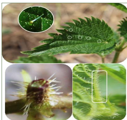
Fig. 8. Urtica dioica (Trichomes)