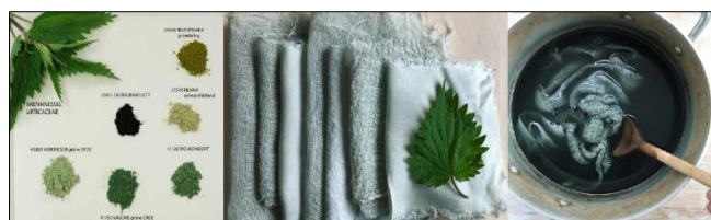
Fig. 2. Dyeing with nettles